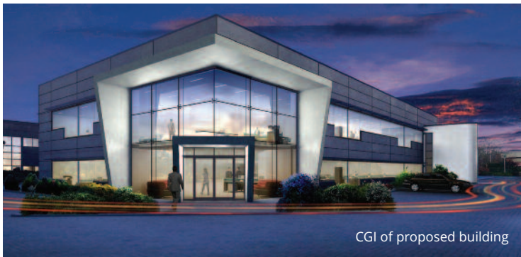
CGI of proposed building