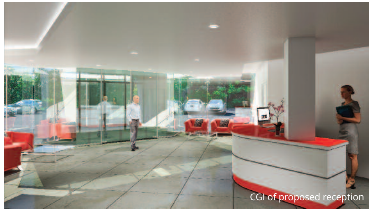
CGI of proposed reception