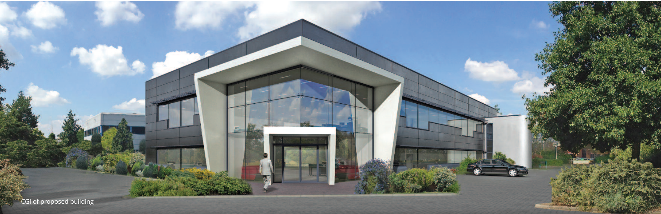
CGI of proposed building

Superb back to frame refurbishment providing a high specification office building with excellent on site parking